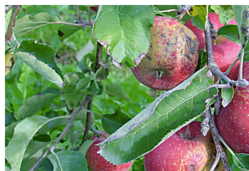
Scab attack on the crop