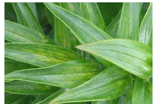
virus attack in lilies